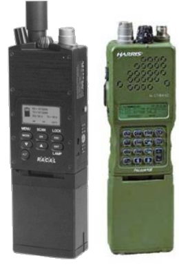
AN / PRC - 148 or 152 Unique Batteries