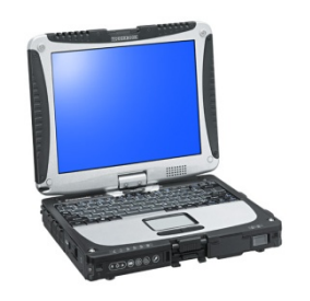
Rugged Laptop Unique Battery